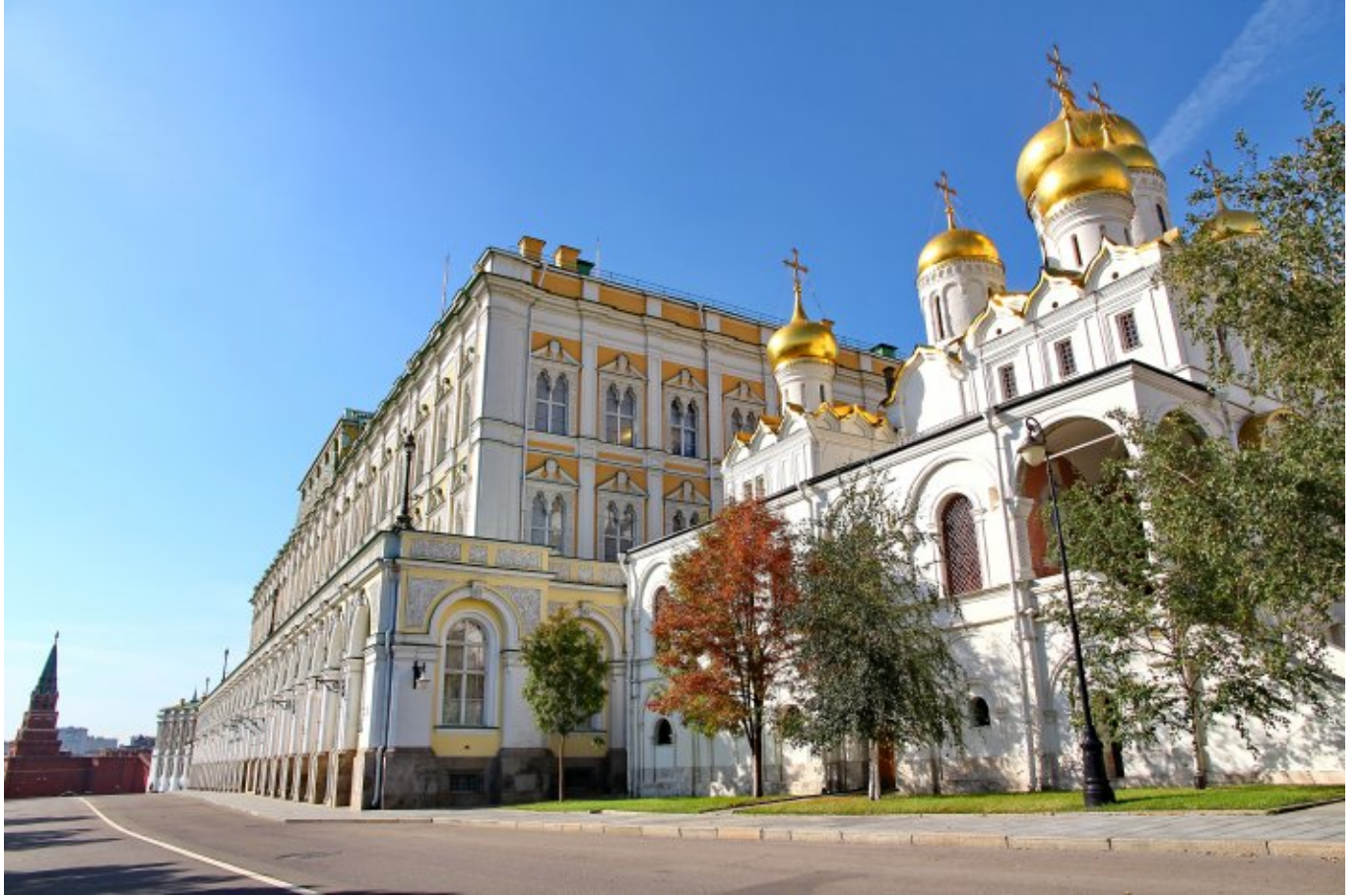
Day six Novodevichy Convent and Subway Ride